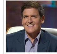
Mark Cuban Co-Owner

Trading Principal BS Math, Stats, Econ, University of Chicago Personal account trading $1 million nominal Family accounts trading $4.5 million nominal