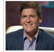
Mark Cuban Co-Owner

Trading Principal BS Math, Stats, Econ, University of Chicago Personal account trading $1 million nominal Family accounts trading $4.5 million nominal